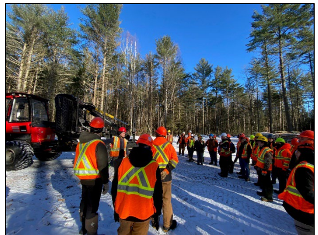
Figure 2. Algonquin College students visit harvest operations in RCF.