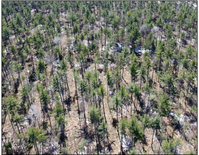
Figure 1. Post-harvest canopy at Beachburg Tract

Approximately 21 local residents were employed on the RCF in 2023 1 , on tendered harvest operations, cutting and skidding or forwarding wood, building roads, processing timber on site, supervising operations, and hauling logs to mills.