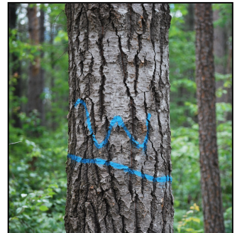
Figure 2. Trees are marked blue for wildlife value.

Of course, there will be temporary disruption to trail use during harvest and regeneration treatments. This work is necessary to ensure that future forest users – human and wild! – will be able to enjoy a beautiful pine forest like we do today. As we have in the past, we will work with the wonderful folks at BORCA and Snow Country to ensure the disruption is as minimal as possible. We hope you will enjoy seeing the future forest develop as we complete our work!