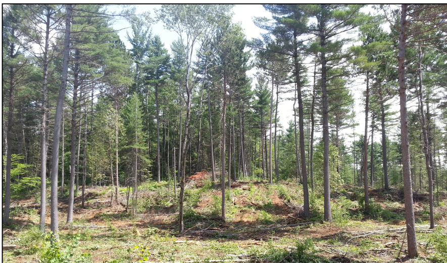
Figure 3. Example of a Seeding Cut, after mechanical site preparation.

Once the pine understory has been successfully established and is well on its way to success (>6m tall), most of the overstory will be removed to make room for the next generation. Veterans will be retained, but as we have seen with recent mortality and blowdown – trees don’t live forever.