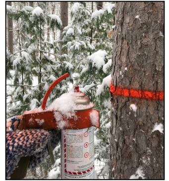
Figure 1. Trees are marked orange for harvest.